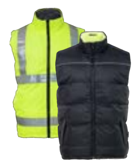
Reversible Insulated Vest