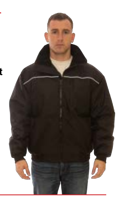
Bomber 1.5 Jacket J26113 Black -Attached Hood