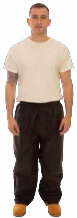
Icon LTE Pants P27113 Black -Snap Fly Front S - 3XL