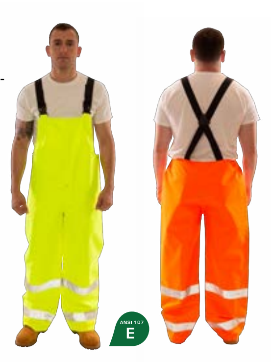
Icon Pants P24123 Black -Snap Fly Front S - 5XL

Fluorescent Orange-Red -Snap Fly Front S - 5XL