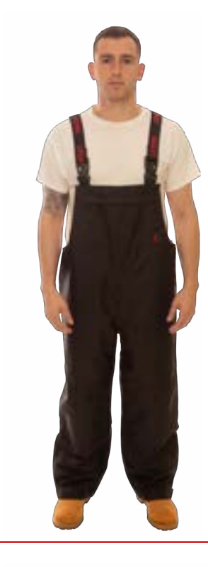
Icon Overall O24113 Black -Snap Fly Front S - 3XL