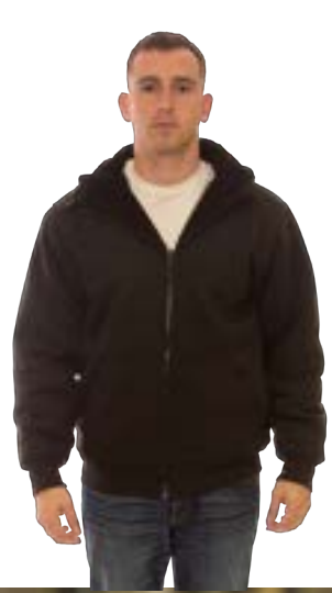
Insulated Sweatshirt S78143 Black -Hooded S - 3XL