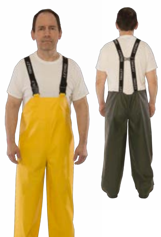
O33017 Yellow -Plain Front S - 3XL