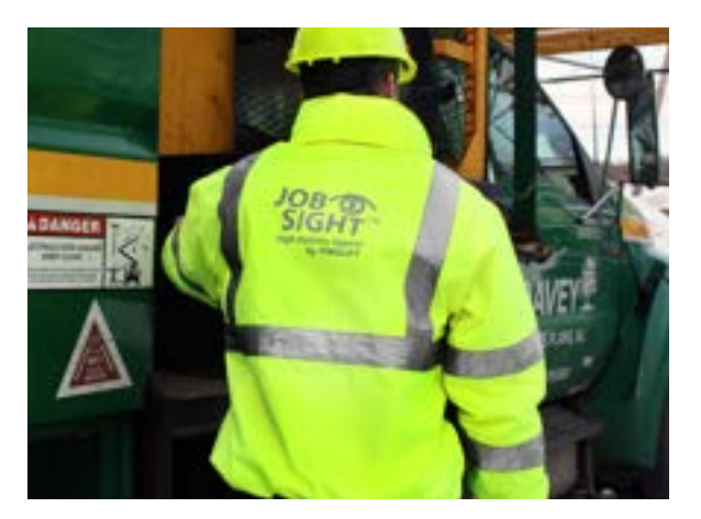
Reflective Heat Transfer