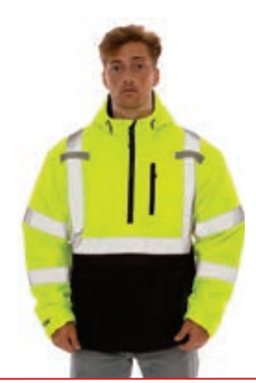
Optix Jacket J26322 Fluorescent Yellow-Green/Black Attached Hood S - 5XL